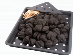
CAST IRON CHARCOAL / SMOKER TRAY #67732