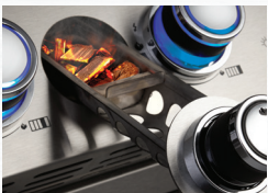
Integrated Wood Chip Smoker Tray