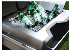
Integrated Ice / Marinade Bucket