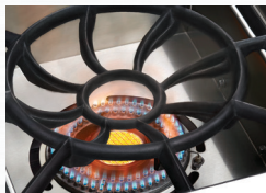
TWO-STAGE Power Side Burner