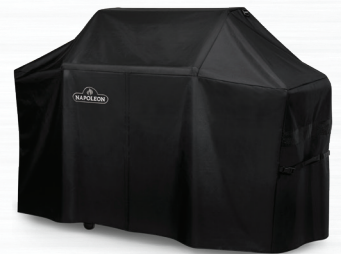
PREMIUM FITTED COVER #61825