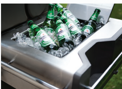
Integrated Ice / Marinade Bucket