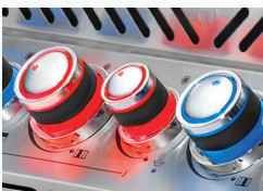
NIGHT LIGHT™ Control Knobs with SafetyGlow