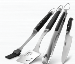
EXECUTIVE FOUR PIECE STAINLESS STEEL TOOLSET #70037