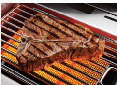
Infrared SIZZLE ZONE™ Side Burner