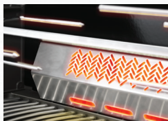
Rear Infrared Rotisserie Burner