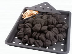
CAST IRON CHARCOAL / SMOKER TRAY #67732