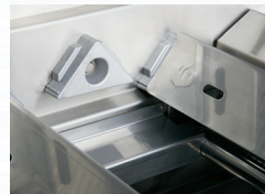
Dual-Level Stainless Steel Sear Plates