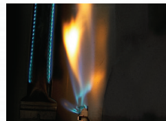
Instant JETFIRE™ Ignition